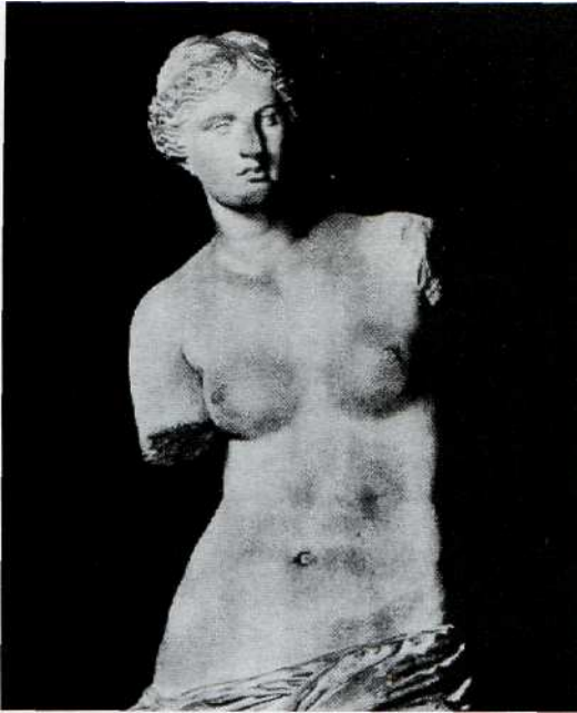
Venus of Milo (Louvre Museum)

darken and go blue. The temples too are rounded and do not project.