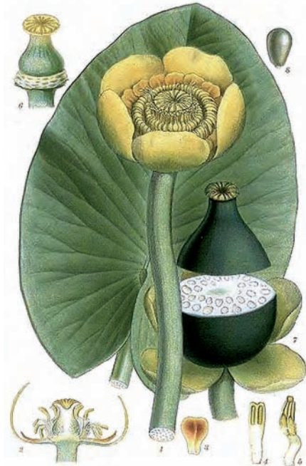
Figure 32: Nuphar luteum - Yellow Pond Lily

with ulcerative damage to the intestinal wall with bloody, slimy diarrhoea from repeated inflammation. Often an autoimmune condition develops which may become cancerous because the sufferer takes on the fatalistic victim role. When something is repeated the sycotic level has been reached.