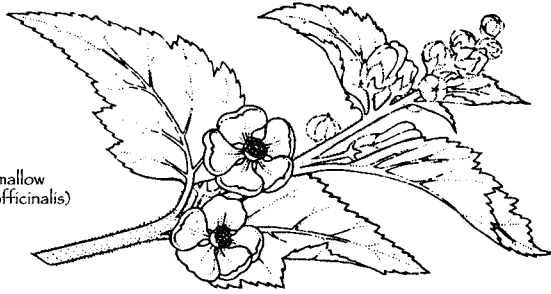
Marshmallow ( Althaea officinalis )